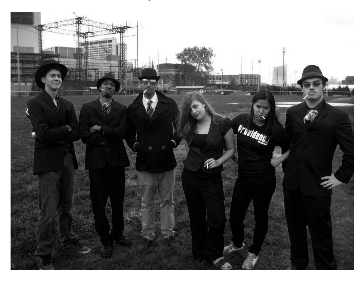
We hope you enjoyed our (fashion) show at the alumni tent!