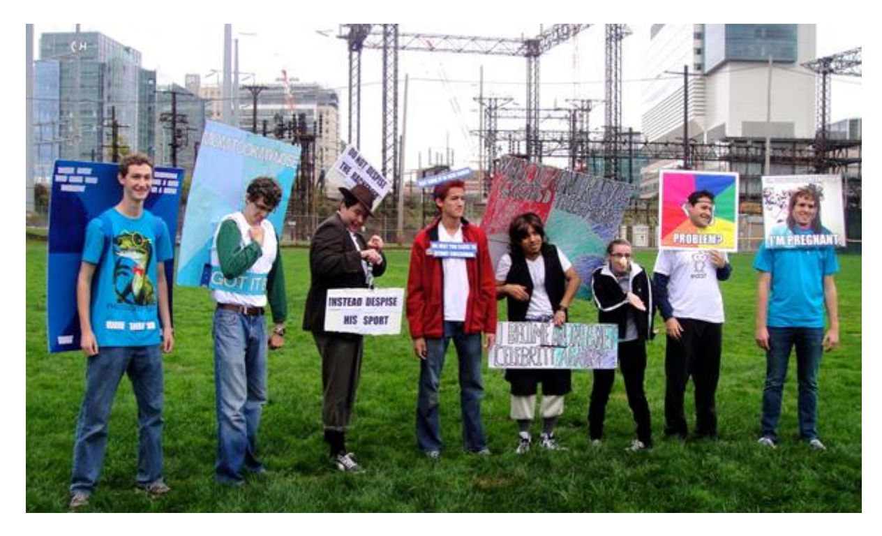
Shown here is the full beauty of our Rock and Trollin' Trump section in their favorite designer memes.