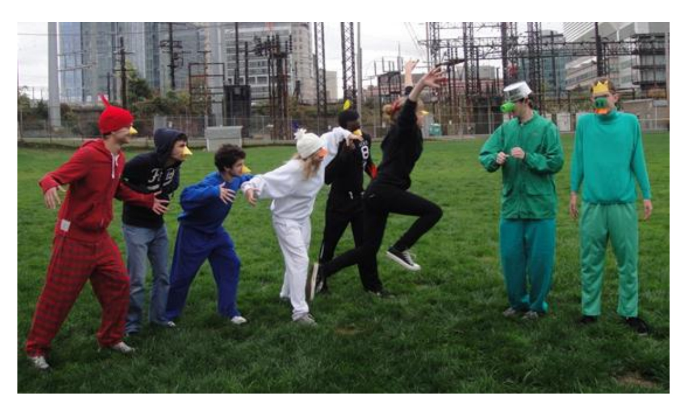
This was a season filled with so many feelings for the trombone section, dressed here in Dior's Angry Birds and Prada's Little Green Pigs lines.