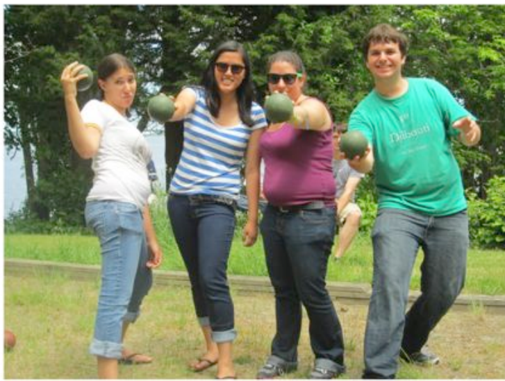
Bocce ball is a serious sport amongst bandies.