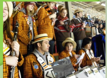
and F. the Princeton Band (now a wholly owned subsidiary of Brown Band, LLC)