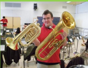
A. New Baritone