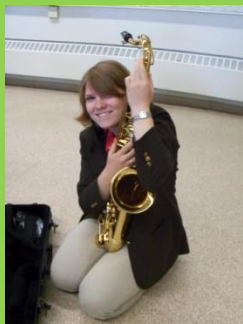
C. Loveable, Huggable Tenor Sax