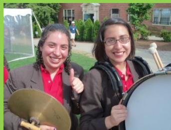
D&E. New Drum Harnesses and New Sticks