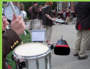
B. More Cowbell