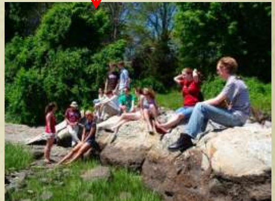
The Band puts on its serious face for the inter-march interlude.