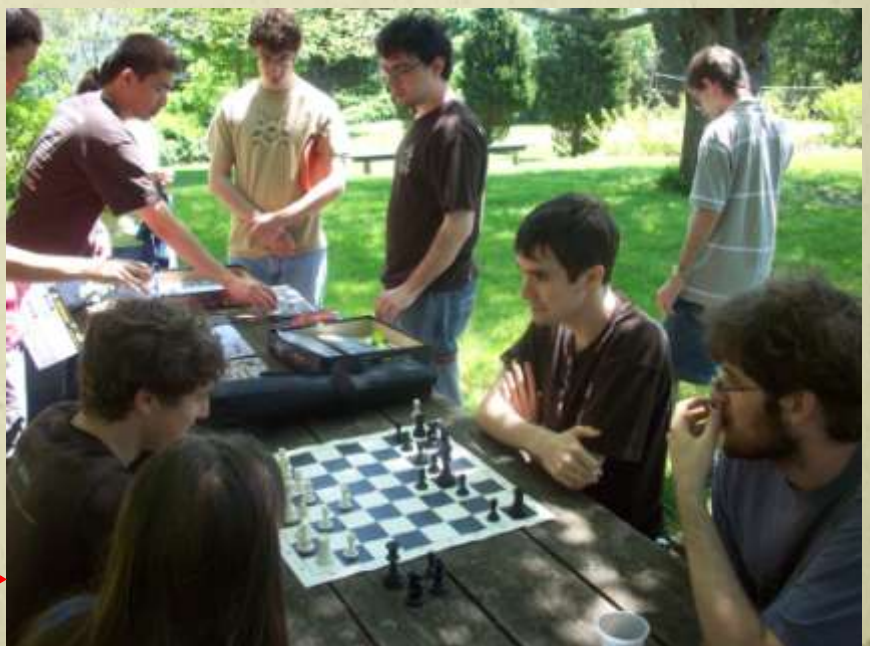
The games children play...